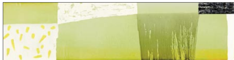
Passeggiata , 2011 by Jerrold Burchman . Acrylic/panel 15" x 60"

Peregrine Galleries Early American & California Paintings & Bakelite • 1133 Coast Village Rd • Daily 12-5:30pm • 969-9673.