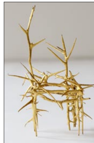
Small Thorn Chair by Michele Oka Doner, Courtesy the Artist

VIP Tickets are $125 per person (pre-sale) or $135 per person at door. VIP includes open-bar privileges and an exclusive champagne preview at 7:30pm. General Admission is $75 per person (pre-sale) or $85 per person at door. General Admission includes auctions, sweets and savories, wine and cocktails, and live DJ. To purchase tickets call 966-5373 or visit sbcaf.org.