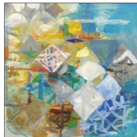
Reckoner , 2011 by Hugh Margerum . Oil/canvas, 42" x 42"

The artists in the exhibition are a mix of native Californians and transplants from across the US, England, and the Isle of Man. Each has spent considerable time in their practice, some for several decades, often in the face of less than desirable public support.