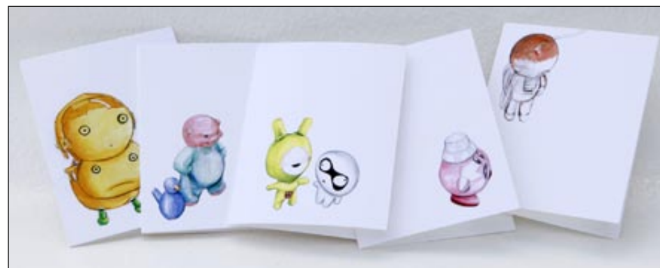
Greeting Cards by James DeWoody. Each pack contains 5 greeting cards and envelopes, edition of 250.

Cabrillo Blvd (State & Calle Puerto Vallarta) 897-1982