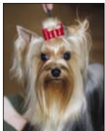
"Bejaze" 15 month Yorkshire Terrier

T HE CRÈME DE LA CRÈME OF DOGS gathered at Earl Warren as The Santa Barbara Kennel Club hosted the 90th SBKC Dog Shows. In conjunction with the SBKC Dog Shows on Saturday and Sunday, August 29th and 30th, the Simi Valley Kennel Club also hosted their show on Friday, August 28th at the same location. The 150 breeds