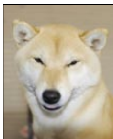
"Gracie" 14 month Shivaina