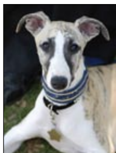
"Nio" 4 month Whippet