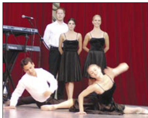
The State Street Ballet performed.