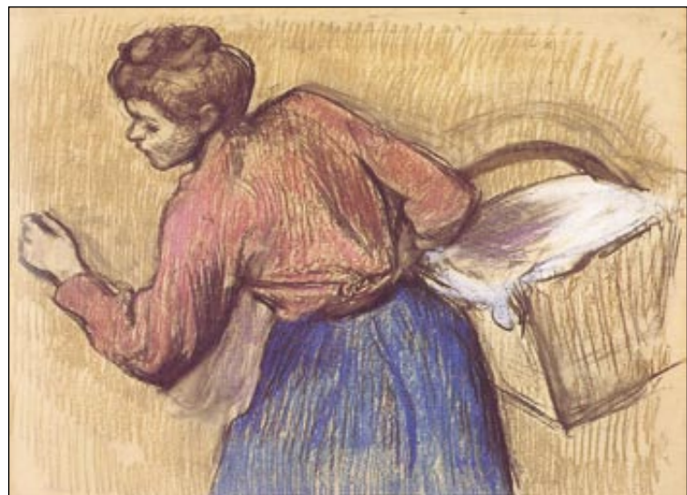
Edgar Degas, Laundress Carrying Linen, 1888-1892. Pastel. Michael Armand Hammer and the Armand Hammer Foundation.