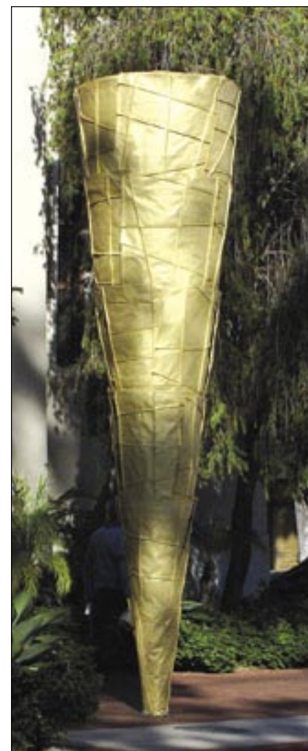
Stupa by Richard Aber is a tall, uncomplicated form, like a golden torch, and big enough to be seen from the heavens. The coated canvas is an unusual material for outdoor sculpture acting like a skin or scales and yet is reminiscent of roof shingles used in building. The title refers to the Buddhist structures erected at sacred sites.