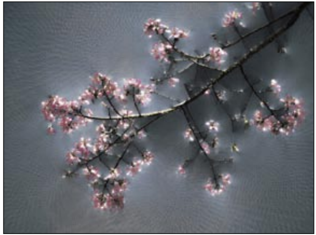
Luck (22"x30") by Murphy Kuhn

A collection of Kuhn’s photography, which includes landscapes, abstracts, and natural flora and fauna, is on display at the Corridan Gallery through July 25th. A