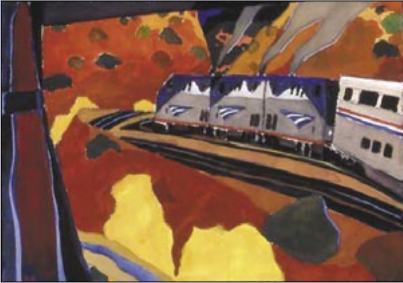
From the Window #32 by Donald Archer. Mixed Media. 15" x 21 1/2"