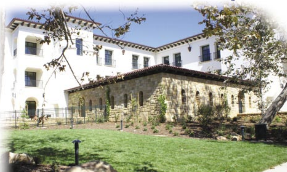
Landscaping for the Public Garden, just outside the Cloister Garden, which will be the location of several art benches and sculptures, is complete.