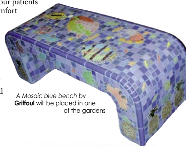
A Mosaic blue bench by Griffoul will be placed in one of the gardens

wanted art to be there for our patients and visitors as a way to comfort and inspire them," Long explained. A significant amount of empirical research supports this position, highlighting the importance of aesthetics and art in the healing process. The next phase of the project will be to install art at the new Goleta Valley Cottage Hospital. Each floor of Santa