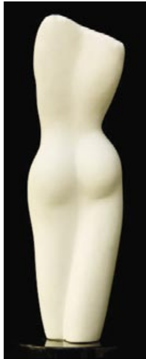
Blanche (marble, 20" x 10" x 10") by Francine Kirsch

"I love the combination of the simple and the complex," said Unkefer. "As I made the selections for the show, I looked first and foremost at how a piece expressed the theme,