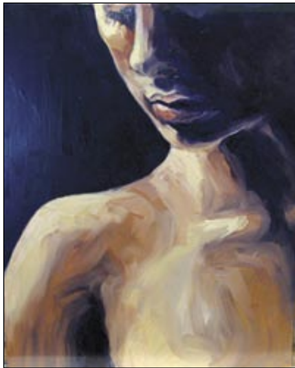
Cup Bearer by Patricia Post

"Landscapes dominate most of the galleries in the area and we wanted to do